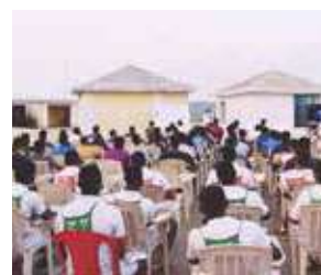
Police Officers on Cyber Security and Forensics