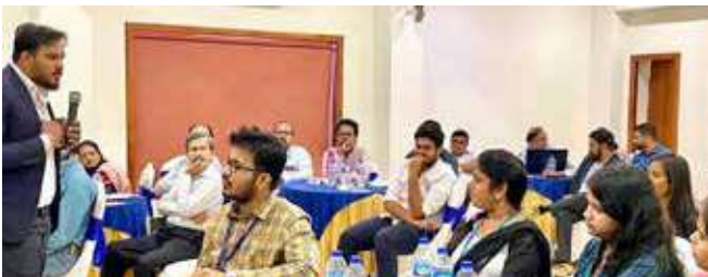
Guest Keynote Speaker on Latest hacks of Cyber Security to all IT Professionals by NASSCOM