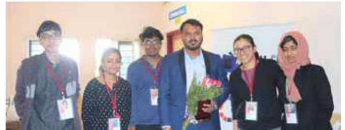
Mentor , Smart India Hackathon, Pune sponsored by Government of India.