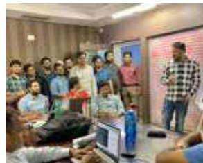
Banking Professionals on Cyber Security and Data Safety