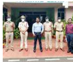
IPS Officers on Cyber Security and Forensics