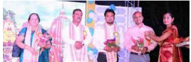
Awarded as Guest of Honour by inaugurating the Global School for kids at Bhubaneswar