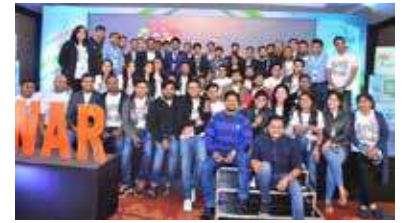
Guest Keynote Speaker at Tech Bhubaneswar 2.0, 2018