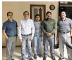
IT & Cyber Security Professionals of 30+ Companies