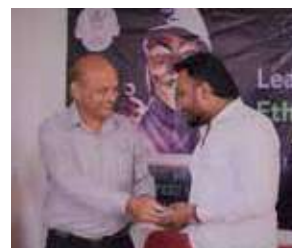
Professors, HODs and Teachers of 25+ Engineering Colleges