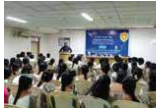
Awarded as Guest of Honour in India's first CISCO Cyberops Workshop and training program sponsored by CISCO at Andhra Pradesh