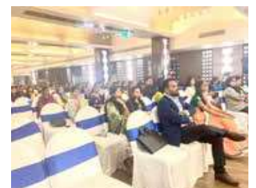
Guest Keynote Speaker for Women in Cyber Security organized by WOH Harmony, Bhubaneswar, 2018