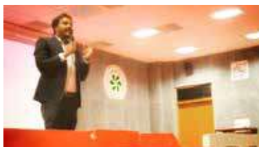
Tedx Speaker at IIIT, Bhubaneswar on Advanced Cyber Security Models