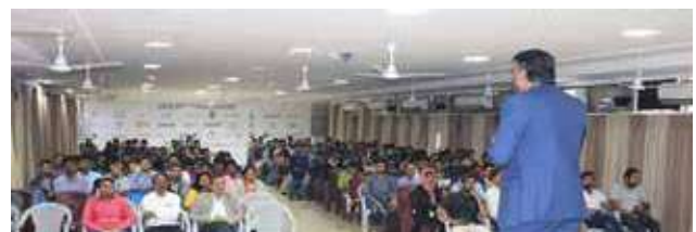
Keynote Speaker as Successful Entrepreneur of Odisha at CET, Bhubaneswar for inspiring students.