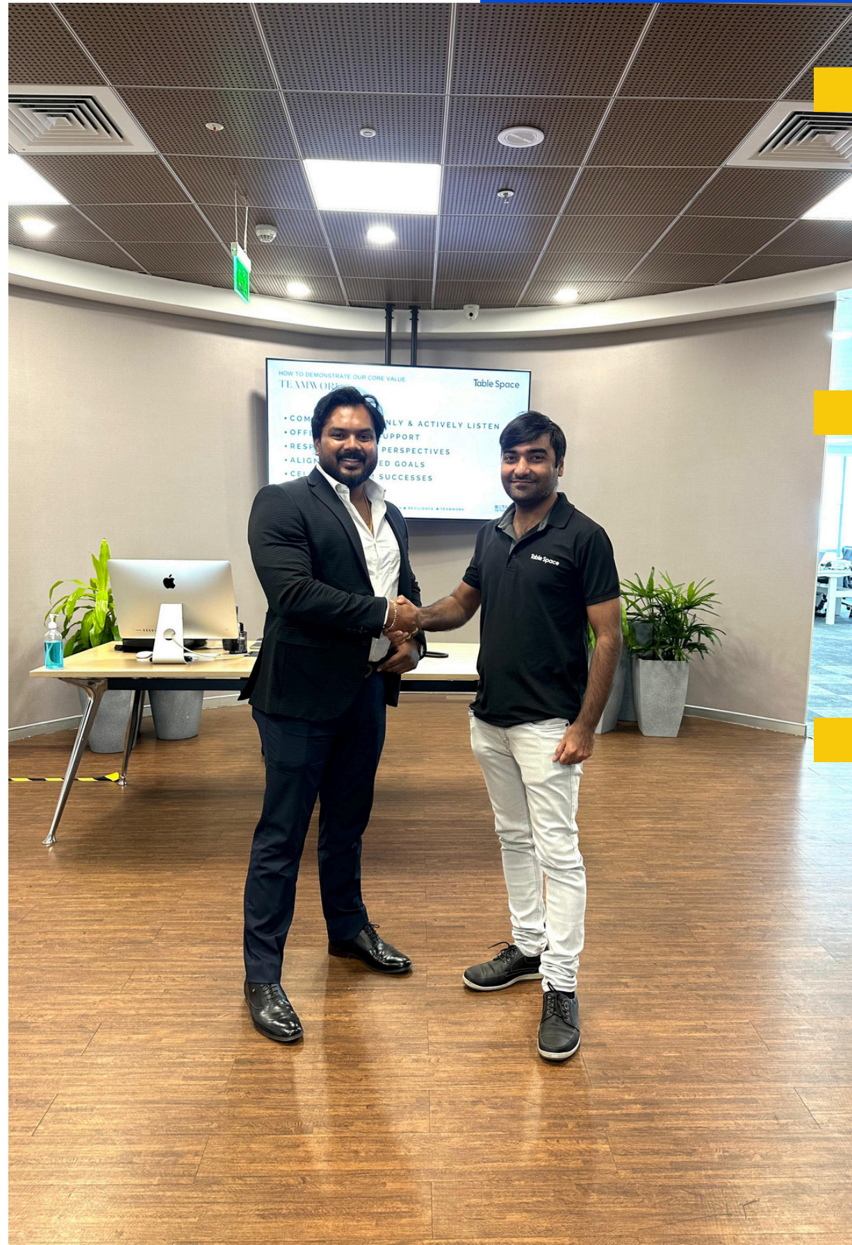
Table Space is a managed workspace solution provider in India, offering a range of workspace solutions for businesses.

Implemented a robust cybersecurity framework across Table Space's national operations.